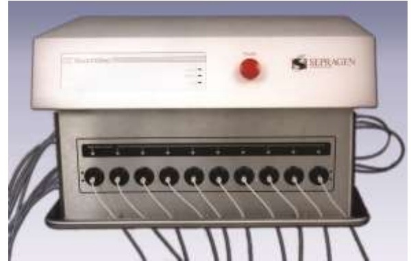
Flow Range 1-100 ml/min

QuantaSep® is a fully integrated system to enable methods development, validation studies, scale-up/ scale-down studies and troubleshooting on a bench scale. With its powerful and easy to use Windows® based software, it allows the user to automatically equilibrate load, wash, elute and regenerate up to three columns. The user can also control each step in the purification based on UV, pH, conductivity, time, temperature, air sensors or any external user-defined variable. As the sensors monitor column outflow, the computer reads the information to automatically change buffers, start gradients and collect fractions, stepping through the method as you programmed it. The computer logs all data for analysis and printout.