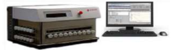
Flow Range 10-1000 ml/min

QuantaSep® is a fully integrated system to truly automate your purification process. With its powerful and easy to use Windows® based software, it allows the user to automatically equilibrate, load, elute and regenerate up to three columns. The user can also control each step in the purification based on UV, pH, conductivity, time, temperature, air sensors or any external user-defined variable. As the sensors monitor column outflow, the computer reads the information to automatically change buffers, start gradients and collect fractions, stepping through the method as you programmed it. The computer logs all data for analysis and printout.