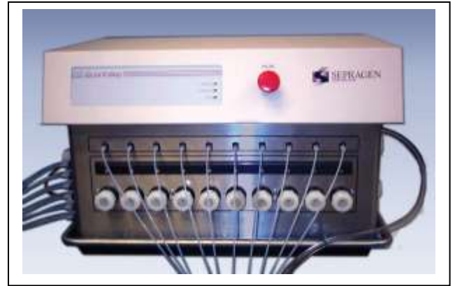
Low Flow: up to 100 ml/min; High Flow: up to 1000 ml/min

QuantaSep® 1000LX is a unique integrated system that enables low flow methods development and high flow scale up in one machine. With its powerful and easy to use Windows®-based software, it allows the user to automatically change buffers, collect fractions and run gradients. The user can control each step in the purification based on UV, pH, conductivity, time, volume, air sensors or any external user-defined variable. All event, alarm, method and chromatography data is logged for analysis or archiving. When methods development is complete, simply switch to the higher flow tubing to scale-up and make clinical product.