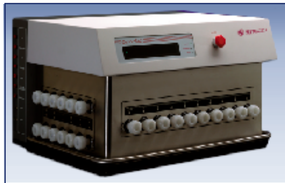
Flow range up to 1800 ml/min

QuantaSep® is a fully integrated system to truly automate your purification process. This sanitary bench top system enables the user to automatically equilibrate, load, wash, elute and regenerate up to three columns. The user can also control each step in the purification based on UV, pH, conductivity, time, volume, air or any external user-defined variable. As the sensors monitor column outflow, the computer reads the information to automatically change buffers, start gradients and collect fractions, stepping through the method as you programmed it. The computer logs all data such as events, alarms and chromatograms for analysis and printout.